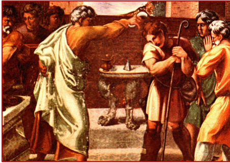
David Anointed As King Raphael